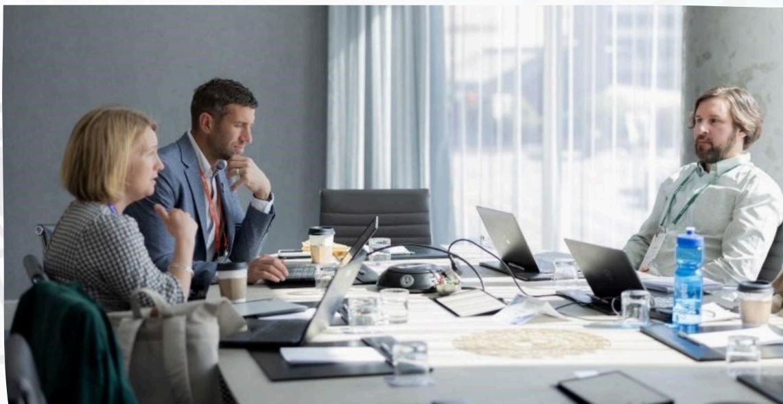
Image: Representatives from Health Care Without Harm and Bupa meet to plan partnership activities and strategies at CleanMed US, May 2024.

Throughout 2025, a full calendar of opportunities awaits Health Care Without Harm and Bupa—from collaboration and engagement at the global, regional, and national levels to driving action on the ground. The more hospitals and health insurers engage with this agenda, the greater and more positive the impact will be.