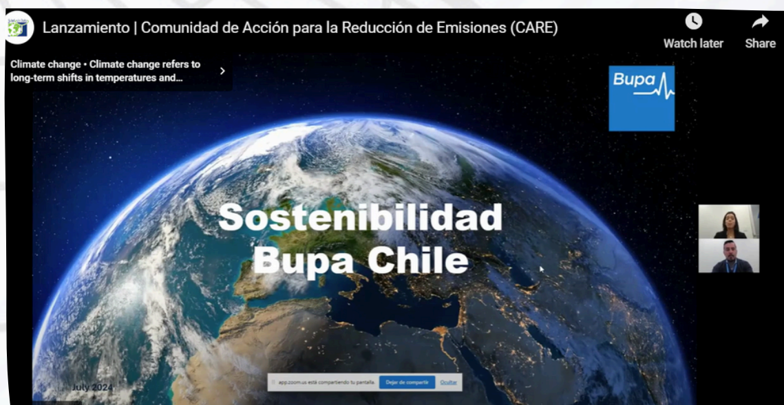
Image: Bupa Chile presentation in LAC C.A.R.E. launch as a success story.

In 2024, the Health Care Without Harm regional offices and strategic partners focused on C.A.R.E. program design and development, conducting research, and creating learning programs tailored to regional priorities. The initiative officially launched in Latin America in September 2024, with launches scheduled in Europe in January 2025 and in the Pacific region in March 2025.