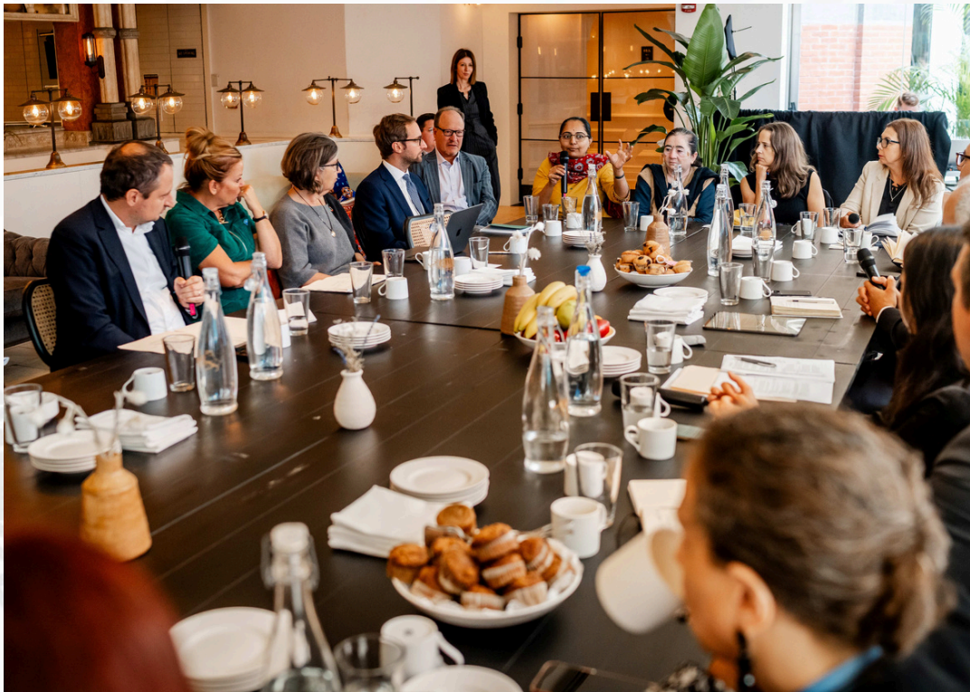
Image: Bupa and Health Care Without Harm co-hosted a session with international health insurers on climate and health at Climate Week New York City.